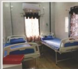
Semi Sp. Room