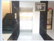
Steel Stretcher Lift