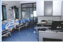
ICU Level II